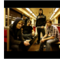
The Classic Crime