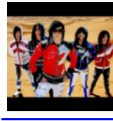
Family Force 5