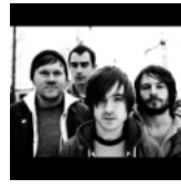
Run Kid Run