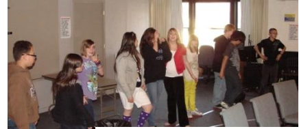
Jr Highers prep for a game